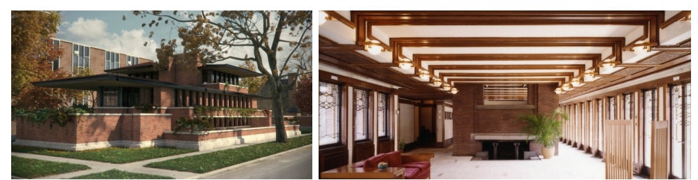
Figure 7. Exterior and Interior Appearance of Frank Lloyd Wright, Robie House (URL-7)

Wright built a series of country houses in 1909 following Art Nouveau period. One of the most important one is "Robie House" (Figure 7). Wright's architectural style free from decorations in parapets of the structure where mass plays are available, in weather strips and eaves horizontal lined forms are seen to be used.