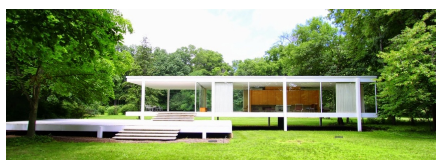
Figure 1. Mies van der Rohe, Farnsworth House as an example for concrete form (URL-1)

Concrete art occurs with the imitation of any object that the designer sees around texturally, formally, chromatically, etc.