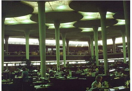
Figure 3. Frank Lloyd Wright, an office named Commercial Buildings as an example for organic form. (URL-3)

Organic architecture, "is a modern architectural style proposed by the famous American architect F.L. Wright. It envisages a creation process including independent design and a structure design integrated with nature. The use of natural materials shows itself by features like flexibility avoidance, horizontal development, etc. Wright used this approach especially for family housings during a long carrier from the late 19th century to 1950s. (Sözen et al., 1996).