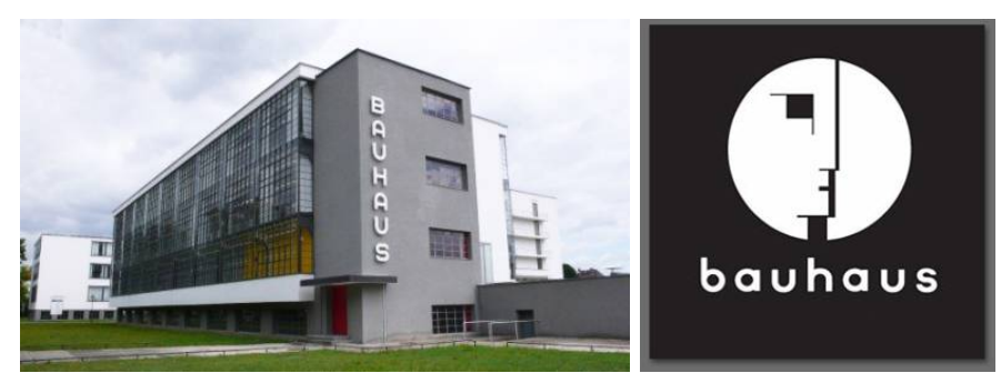
Figure 9. Walter Gropius-Adolf Meyer, Bauhaus, Dessau, Germany, 1925–1926. (URL-9)

Architecture coming to a full stop because of the World War 1 revived with the "Bauhaus" school founded in Dessau by Geramn Architect Walter Gropius in 1925–1926. Bauhaus school is the most comprehensive breakthrough aiming to apply modern style in all interdisciplinary branches (Kuban, 1990). With this movement, serial production concept was added to modern forms and it started the creation process. In this way, industrial product design which was an unknown concept until Bauhaus became a part of architecture.