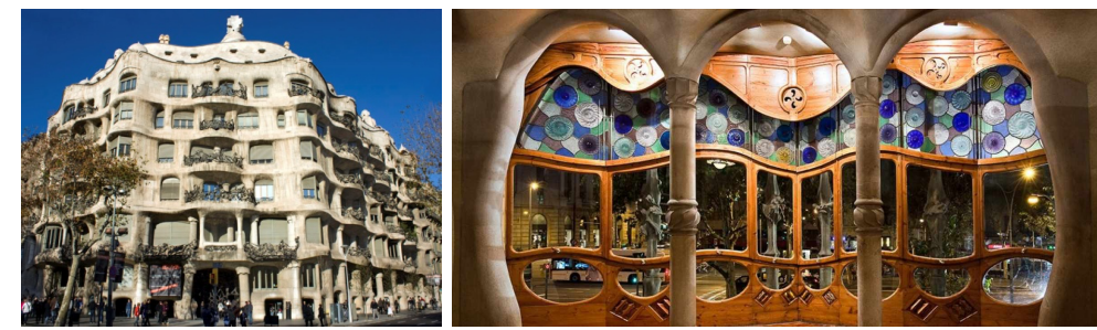
Figure 6. Exterior and Interior Appearance of Antoni Gaudi, Casa Mila, Barcelona, 1905–1910 (URL-6)

Catalonian Antoni Gaudi is the most extraordinary architect of Art Nouveau period. Curvilinear structural walls improved the architecture with thin masonry vaults.