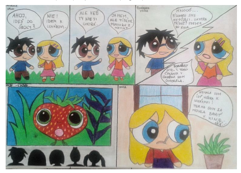
Fig. 3: The texts and pictures represent different languages that are supplementing each other when used together. The authors of cartoon stories are the pupils from the Elementary School of Vranov nad Toplou, Slovakia.

Fransecky and Debes (1972) define the basic objectives in learning and teaching of visual literacy as the "ability to read the visual images made for goal-directed communication, the ability to design visuals for goal-directed communication, to make the images for goal-directed communication, to combine visual and verbal languages for goal-directed communication"(p. 12). However, the development of visual literacy depends upon the interaction of the child with images, objects or other visual forms. Visual language must be developed purposefully in the early childhood, to direct the child and create the conditions for these creative activities. All this with the aim to develop his/her imagination and the "reading" of pictures with understanding, as well as the visual (self-)expression (Fig. 3).