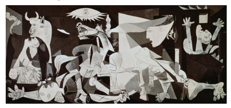
Fig. 2: Pablo Picasso, Guernica, 1937, oil on canvas, 349.3 x 776.6 cm. Picasso made forty-five preparatory drawings and he worked on six versions of the canvas till he created the final version for the Paris International Exposition in July 1937.

Visual literacy is the cognitive quality, yet it draws also from the affective area. We have to learn to critically and creatively think, communicate the contents as well as to create meanings. This is not the congenital property. Thus we need to master the ability to observe, deduce, and reveal stories. Also to find the information and analyse the arguments why they came into existence, to think about details, to formulate an opinion. Saying it in simplified way, we must learn how to visually "read", how to understand the contents (Fig. 2). This means to answer the questions of the following type: What am I looking at? Where is it? Who is it? What did happen? What feeling is evoked by the picture in me? What is the meaning of the picture for me? What story is hidden behind the picture?