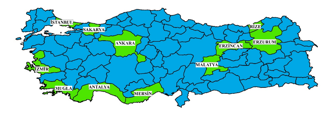
Figure 1. Cities which transportation master plan was examined in Turkey

Within the scope of the study, different urban sizes, demographic structure, structure of land, urban uses, transportation patterns, and comparison of cities having different characteristics have been made. Cities whose comparison has been made have been determined as İstanbul, Ankara, Mersin, Antalya, İzmir, Sakarya, Erzurum, Muğla, Malatya, Erzincan and Rize. In this comparison, as seen in Figure 1, setting forth things carried out within the context of the projects on bicycle transportation taking place in accomplished and approved transportation master plans on the basis of both metropolitan cities and small and medium-scaled cities, and evaluating the present situation have been taken as the basis.