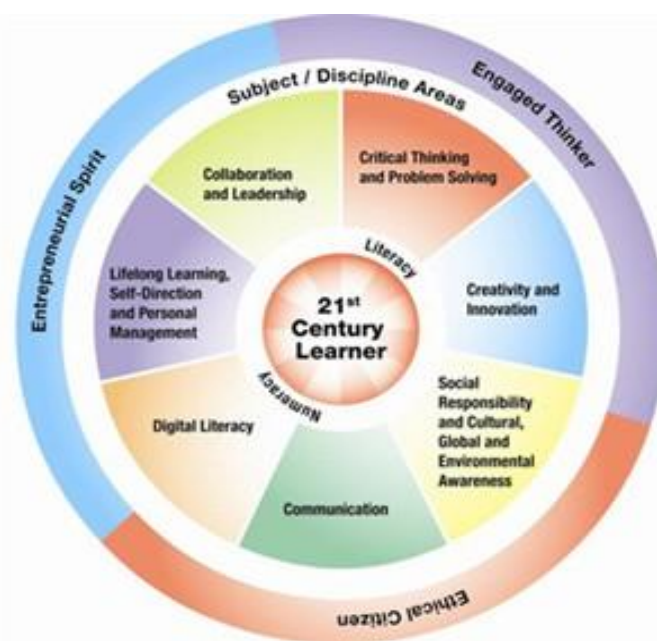
Figure 2: Alberta Education Framework for Student Learning (Alberta Education 2011, 2)

The graph below is a representation of both types of competencies for secondary education in the province of Alberta, by the ministry of education Alberta Education.