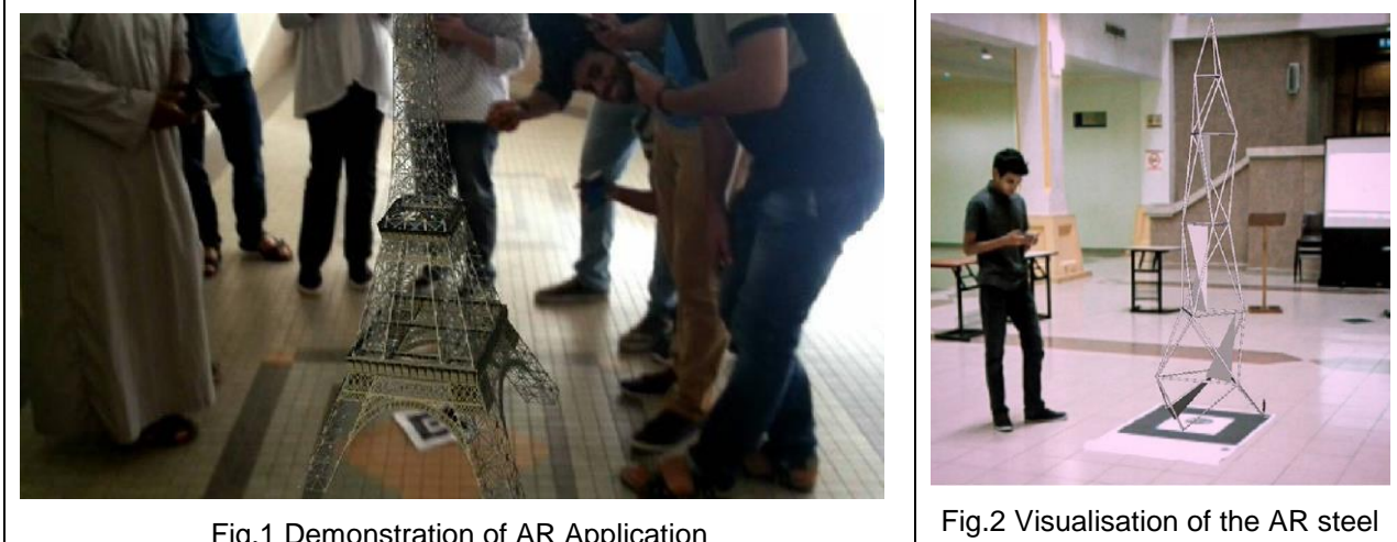
Fig.1 Demonstration of AR Application

Second, students held an exhibition where they could demonstrate to their peers the learning content that they have developed. The presentation and demonstration were conducted in an informal outside classroom environment. For visualisation, students would have to scan the QR code and download the AR models files into their mobile storage. Then, the mobile camera will track the AR marker and generate interfaced view of the steel construction model in the real-time environment. Fig.1 shows the demonstration of AR application outside the classroom environment, and Fig. 2 shows a student interactively visualises the AR steel structural model.