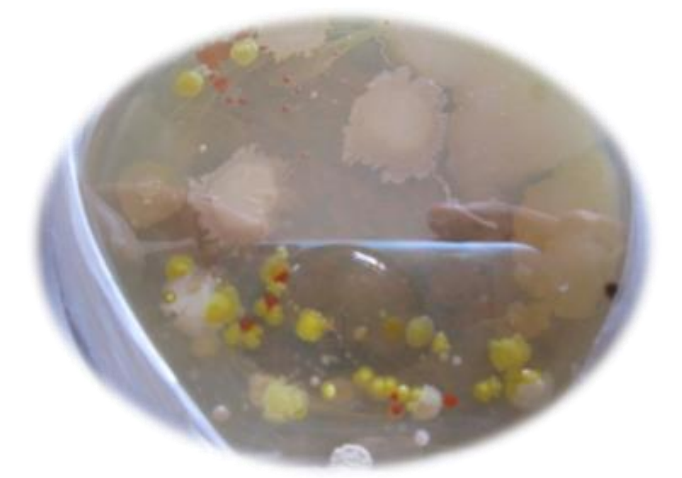
Fig. 2: Microbial load present in a plate grown by the students in which there are grown recognizable colonies of Staphylococcus aureus (golden colonies), Serratia marcescens (red colonies) and various types of moulds.

As easily predicted, in the Petri dish sawn with dirty hands, not only bacteria did grow, but also other types of microorganisms. In fact, in addition to bacteria such as Staphyloccus aureus , easily recognizable by the golden colour of its colonies, and some colonies of Serratia marcescens , bright red in colour, many moulds were recognizable, of various types and colour (Fig.2).