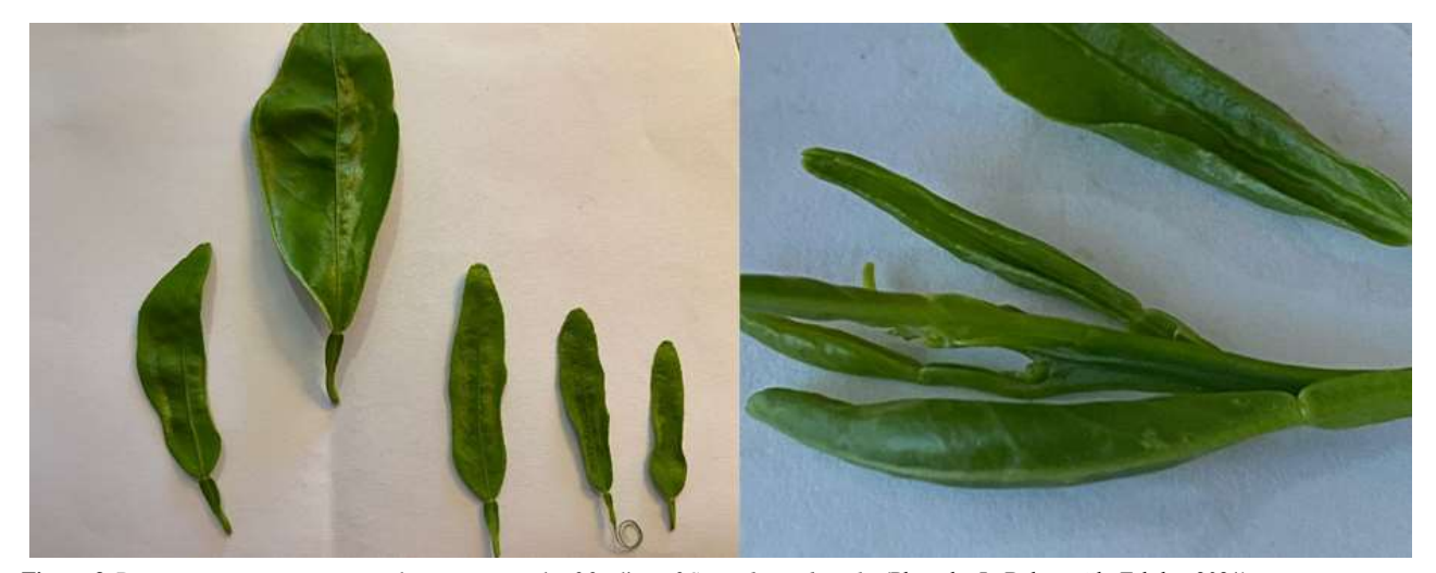
Figure 3. Damage symptoms on orange leaves as a result of feeding of Scirtothrips dorsalis.

Effective control methods for S. dorsalis are still in the research phase. Some suggestions including crop rotation, removal of host weeds, and introducing predators or parasitoids have been made by the World Vegetable Center (AVRDC) to control this harmful thrips. Besides, it is always recommended to use insecticides from different classes in order to prevent the development of insecticide resistance. While synthetic pyrethroids can not effectively suppress S. dorsalis in pepper (Seal et al. 2006), soil or green parts applications of imidacloprid, one of the neonicothionide group insecticides, provides successful results in the management of S. dorsalis without harming beneficial insects (Seal and Kumar 2010). Foliar applications of imidacloprid from the soil much more successful