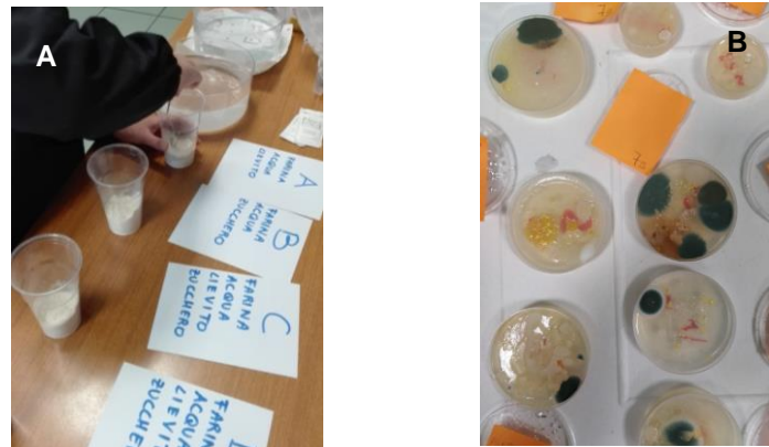
Figure 1. Experimental activities undertaken by using the scientific method.

The second column of the Table 2 contains the activities of the control group held by the tenured teacher. As regards the contents, they are not exactly corresponding in the two classes because of the different approach used and the variety in the pupils' way of learning.