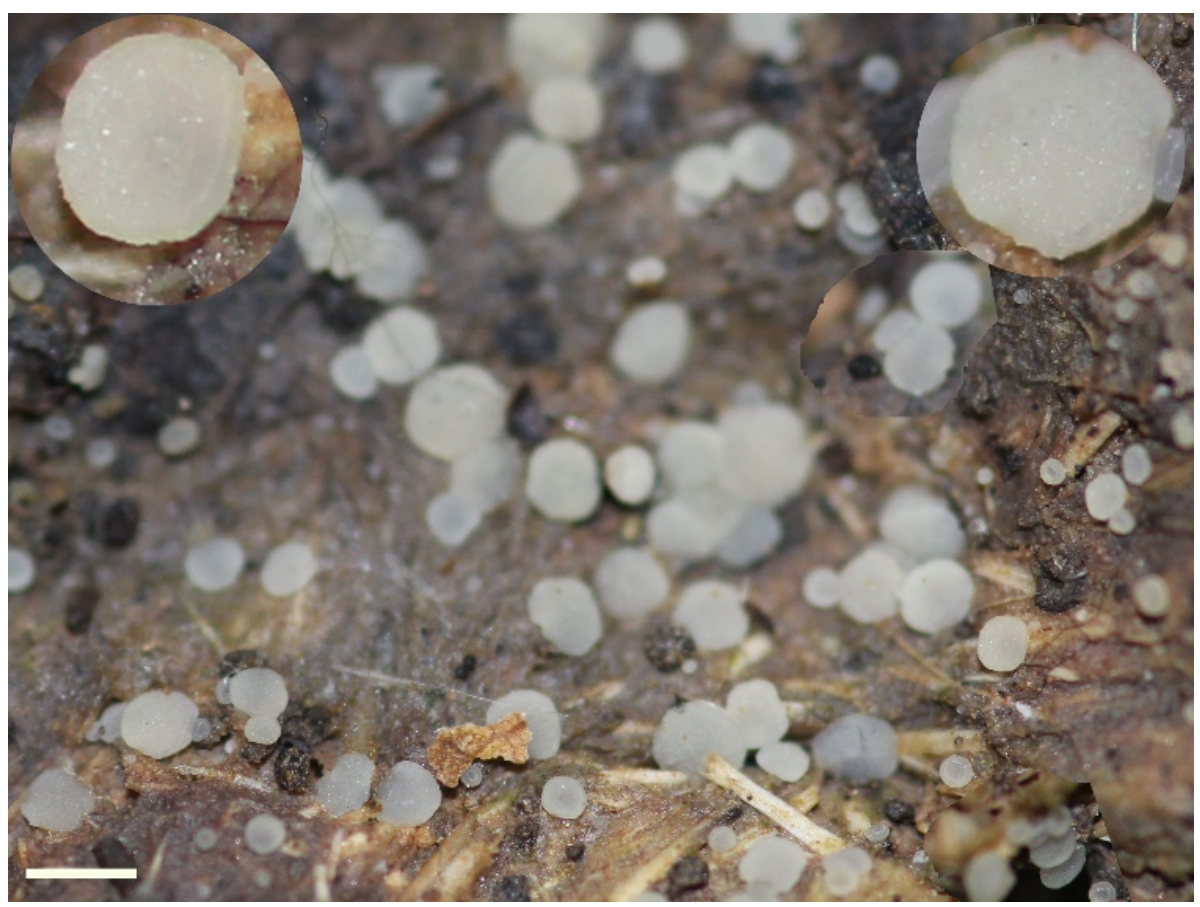
Figure 1. Fresh ascomata of Coprotus disculus. Scale bar = 1 mm

Specimen Examined: TÜRKİYE, Hakkâri, Şemdinli, Derya village input, 37° 21′271″N, 44° 31′282″E, 1525 m, on the dung of cow, 28.03.2018, VANF Acar. 1014.