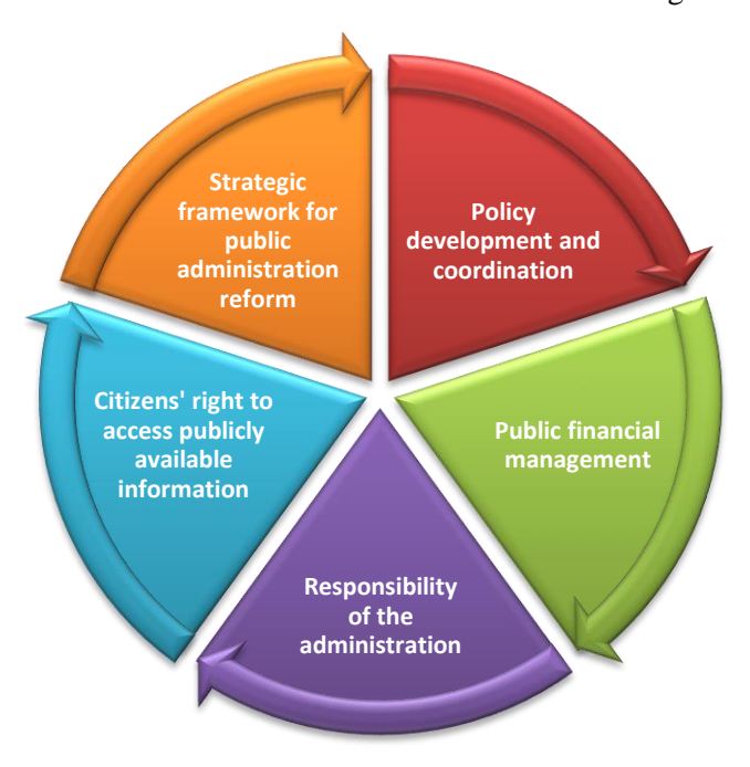
Figure 2. Key areas of public management reforms in Turkiye

The figure shows that public administration reforms can be built on five main issues. One or more of these may be subject to a public administration reform. In the 2018 EU progress report, the Turkish public administration reform was evaluated under these headings.