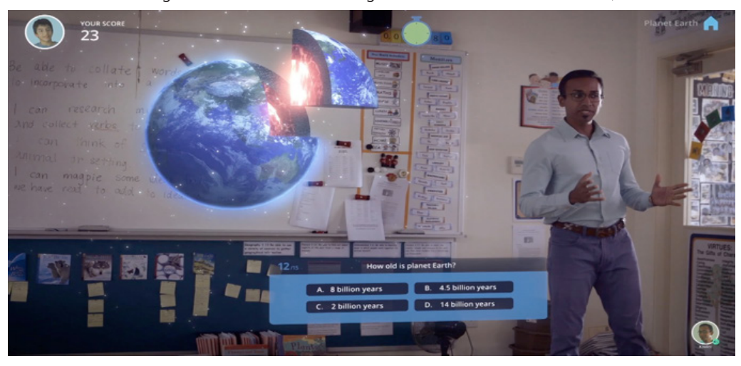
Figure 3. Augmented reality in education

There is growing evidence that simulation in teaching is necessary to improve learning, skills, and outcomes, efficient skills. In the health sciences, high-fidelity task trainers are ideal for reducing cognitive load and enhancing learning outcomes (Birt et al., 2017). It is expected to be widely used in academic and business education fields. For example, some parts of the training program developed by Microsoft and Japanese Airlines were introduced to the whole world in July 2016. It shows how an airplane jet engine comes in front of the user with hologram images and how the user enlarges, reduces, or rotates this image in the desired directions by using his fingers as a mouse. People using the headgear above can also verbally intervene in the virtual images before them. E.g., the MR system reacts very quickly to the command to show the ventilation and cooling system of the jet engine and can instantly bring the desired design. There is no need to go to the hangar where that massive jet engine is located to receive this training. In addition, they do not divide those jet engines, which are very expensive, into parts for educational purposes and present them to the students' examinations. MR technology overcomes all these difficulties. Simulations such as all kinds of laboratory tests and examinations in the battlefields in history lessons will attract the students' attention, reduce the learning time and make learning easier (Özdemir and Öztürk, 2022).