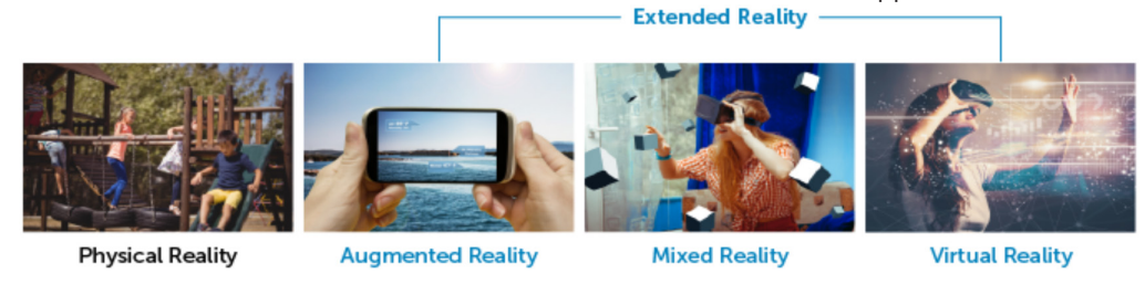
Figure 1. Different pictures for Physical, Augmented, Mixed and Virtual Realities

Imagination and reality have never been intertwined. For years, VR has been the "next big thing". Still, it has finally emerged to create stunningly realistic images, sounds, and other emotions amid an extraordinary fantasy world. Almost everyone has access to these fascinating technologies, but before pouring hard-earned money into a cutting-edge head-mounted display, let us take a closer look at what is needed for an amazing VR, AR, or MR experience. Technology has caught on, and market researchers have predicted rapid growth for the VR industry. Look-in toys were popular in the 1950s, and indoor flight simulators were first introduced in the 1960s, but the idea of VR goes even further. As early as the 1940s, inventors, science fiction writers, and fixers dreamed of an environment that could escape reality through art and machinery. VR can be used as a general term to describe similar but different technologies to the actual VR experience. The similarities and differences between VR, AR, and MR should be apparent (Intel, 2021).