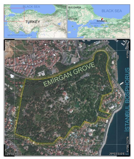
Figure 1. The location map of the study area.

Emirgan Grove is located in the north of Istanbul, in Sarıyer District of the province of Istanbul. It is located on the shores of the Bosporus, between Emirgan and Istinye districts. It is spread over ridges and slopes on an area of 47.2 hectares on the shores of the Bosporus (Fig. 1). There are a total of 211 different tree and shrub species in Emirgan Grove. A total of 9388 trees and shrubs belonging to these species continue to exist in the grove. The important trees of Emirgan Grove are; Carpinus betulus L., Fraxinus angustifolia Vahl, Aesculus hippocastanum L., Platanus orientalis L., Platanus x acerifolia Willd., Quercus petraea (Matt.) Liebl., Quercus robur L., Quercus frainetto Ten., Quercus cerris L., Pinus pinea L., Pinus pinaster Aiton, Pinus brutia Ten., Pinus halepensis Mill., Tilia tomentosa Moench, Cedrus libani A. Rich., and Corylus colurna L. (Akkemik et. al. 2021).